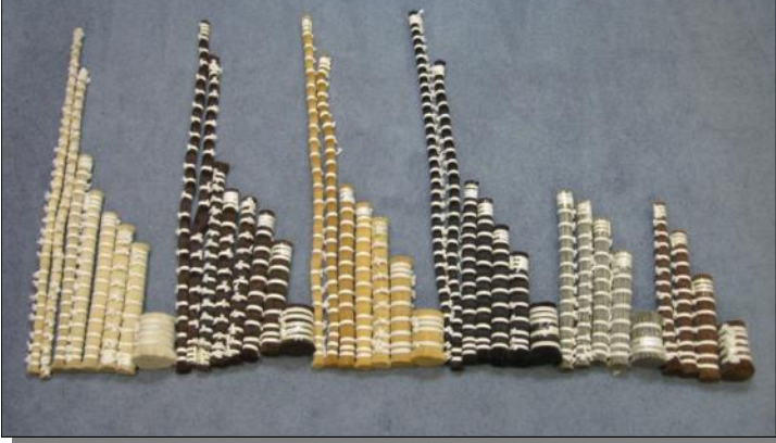
702-xx Double Drawn

In addition to our dried and tanned horse tails shown in the tail section of this catalog, we offer double-drawn (i.e., straight cut at both ends) in one-pound bundles in various sizes and colors.