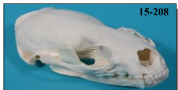
Otter Skull Lontra canadensis