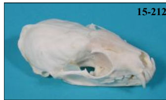
Marten Skull Martes americana