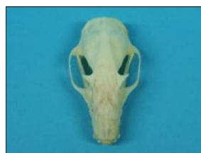
Leschenault's Rousette Fruit Bat Skull Rousetus leschenaultii