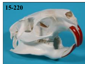
Nutria Skull Myocastor coypus