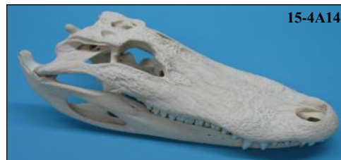
Alligator Skull Alligator mississippiensis

(1) Not on the U.S. Endangered Species List. Subject to CITES III; not for export. (2) Extensive state restrictions. Subject to CITES; not for export. NY permit needed. See web for gallery pictures.