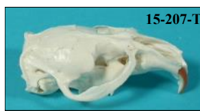
Muskrat Skull Top Ondatra zibethicus