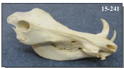
Warthog Skull Phacochoerus africanus