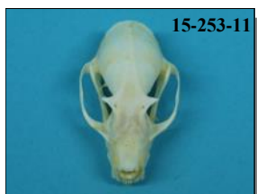
Short-Nosed Fruit Bat Skull Cynopterus sphinx