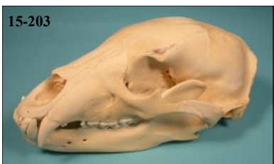
Black Bear Skull Ursus americanus