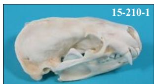
Striped Skunk Skull Mephitis mephitis