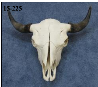
Buffalo Skull Bison bison