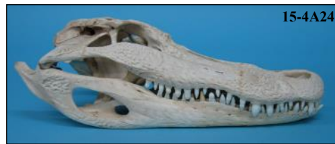
Alligator Skull Alligator mississippiensis

If you are interested in any skulls that are not listed in this catalog, let us know and we may be able to get them for you.