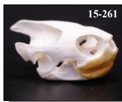
Red Ear Turtle Skull Trachemys s. elegans

If you are interested in any skulls that are not listed in this catalog, let us know and we may be able to get them for you.