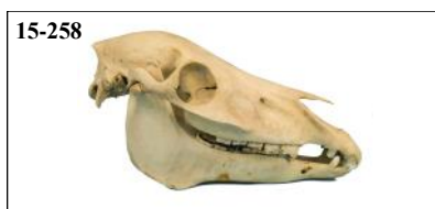
Pony Skull Equus caballus