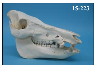
Wild Boar Skull with Tusks Sus scrofa

The skulls are professionally cleaned with peroxide and the jaws may be separate or glued together.