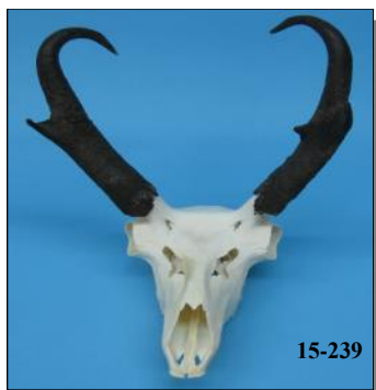
Pronghorn Skull with Horns Antilocapra americana