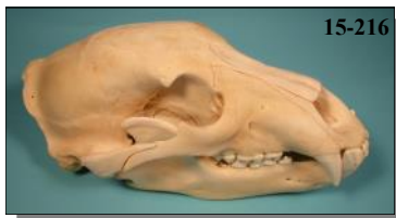
Grizzly Bear Skull Ursus arctos