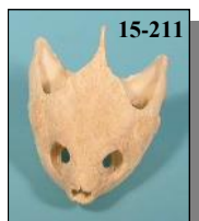
Common Snapping Turtle Skull Chelydra serpentina