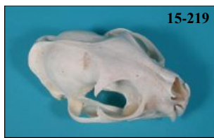
Bobcat Skull Lynx rufus