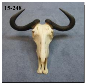
Blue Wildebeest Skull Connochaetes taurinus