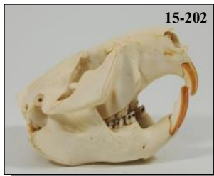
Beaver Skull Castor Canadensis