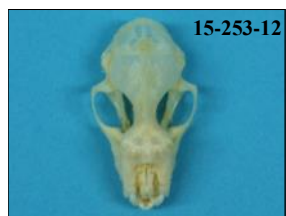
Roundleaf Bat Skull Hipposideros diadema