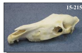
Zebra Skull Equus quagga