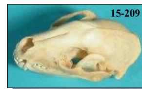
Raccoon Skull Procyon lotor