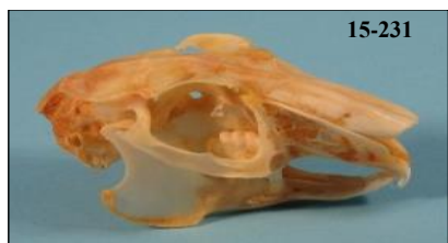
Jack Rabbit Skull Lepus townsendii