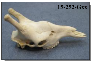
Giraffe Skull Giraffa camelopardalis