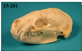
Badger Skull Taxidea taxus