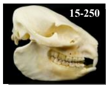
Rock Hyrax Skull Procavia capensis