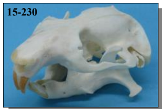
Mountain Beaver Skull Aplodontia rufa