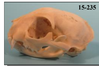
Cat Skull Felis catus

The buffalo, cow, elk, horse, and many other skulls do not have lower jaws.