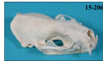
Mink Skull Neovison vison