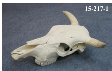
Steer Skull with Cores/No Horns Bos taurus