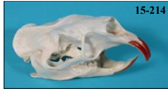
Porcupine Skull Erethizon dorsatum