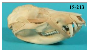
Opossum Skull Didelphis virginiana