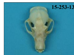
Cave Nectar Bat Skull Eonycteris spelaea