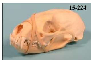
Fisher Skull Martes pennant