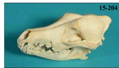
Coyote Skull Canis latrans