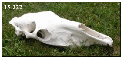
Horse Skull Equus caballus