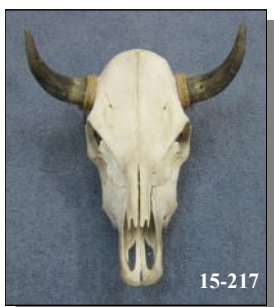
Steer Skull Bos taurus