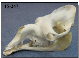
Camel Skull Camelus dromedarius