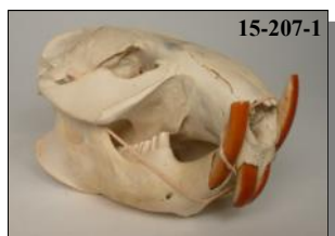
Muskrat Skull Ondatra zibethicus