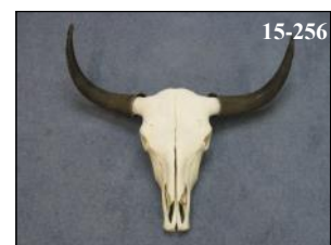
Yak Skull Bos grunniens