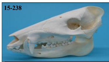
Javelina Skull Pecari tajacu