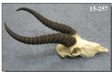
Springbok Skull Antidorcas marsupialis