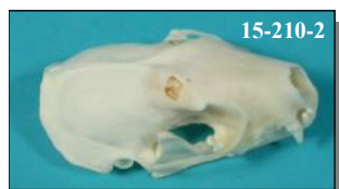
Spotted Skunk Skull Spilogale putorius