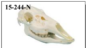
Deer Skull Odocoileus virginianus