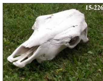
Cow Skull Bos Taurus