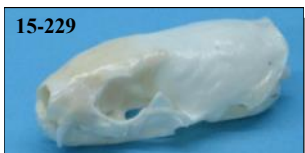
Ermine Skull Mustela ermine