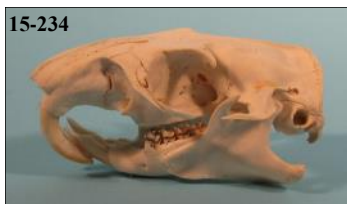
Marmot Skull Marmota flaviventris