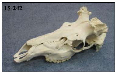
Elk Skull Cervus elaphus