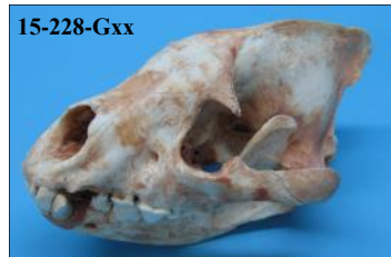
Hyena Skull Crocuta crocuta