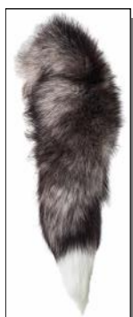
18-05-57-SEL Indigo Select