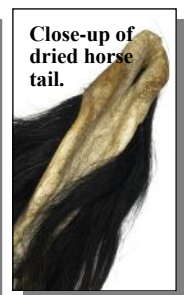
Close-up of dried horse tail.

The regular horse tails are 39" or longer. The short horse tails are under 39" long. The first 6" or so where the tails attached to the body are quite hard and stiff. The dried tails are de-boned, scraped, washed, and dried. The tanned tails are softer. Please note that not all colors are available at all times. ( Equus caballus, ranch ).