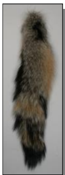
18-05-0 American Gray