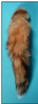
18-05-6 North American Red