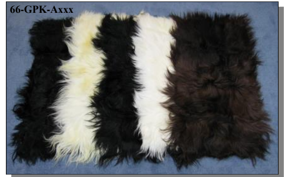
Left to Right: Black, Natural White, Dark Brown, Bleached White, and Chocolate Brown