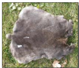
Craft Grade: Front