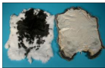
Gift Shop Grade: Front and Back