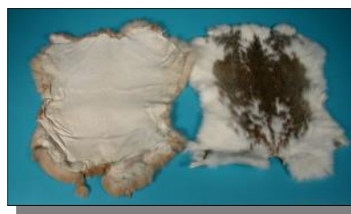
Better Grade: Front & Back