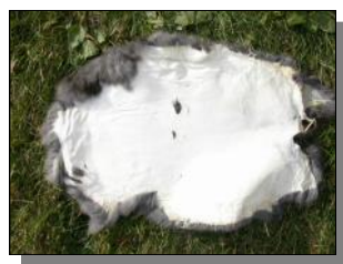
Cut-Up Grade: Back