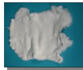
Garment Grade: Bleached White