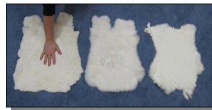
Left: Czech Female White Shorn (283-1-CZWS)