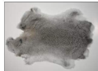
Better Grade: Front