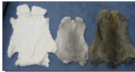
Left: Jumbo Czech Heavy White (283-1-CZW-AS) Middle: Regular size Spanish Better Grade Natural (134-01N) - shown on previous page Right: Jumbo Czech Heavy Natural (283-1-CZNAT)