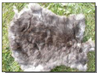
Cut-Up Grade: Front