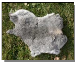
Craft Grade: Front