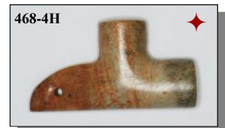
3 3/4" long, 2 1/2" high