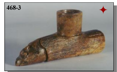
4" long, 2 1/4" high