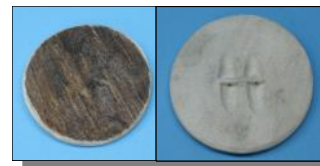
38-PB-2.5 Left: Front / Right: Back