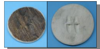
38-PB-2.5 Left: Front / Right: Back