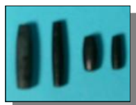
Regular vs. Ultra Thin

We offer black horn hairpipe in regular and ultra thin. ( Bubalus bubalis, ranch ).