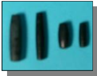
Regular vs. Ultra Thin

We offer black horn hairpipe in regular and ultra thin. ( Bubalus bubalis, ranch ).