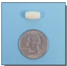
Regular 0.5" shown with a quarter