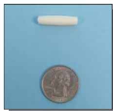
Regular 1" shown with a quarter