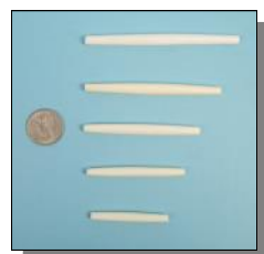
Regular 2" to 4" shown with a quarter