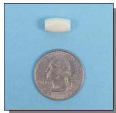
Regular 0.5" shown with a quarter