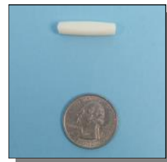
Regular 1" shown with a quarter