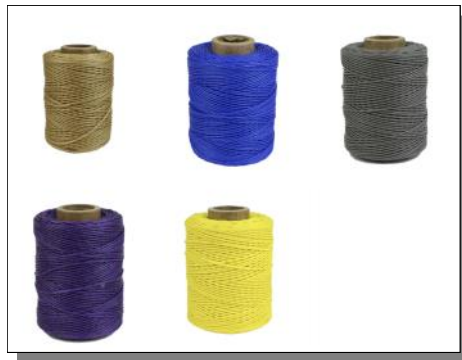
TW18-2W-2BE, BL, BV, PP, YL