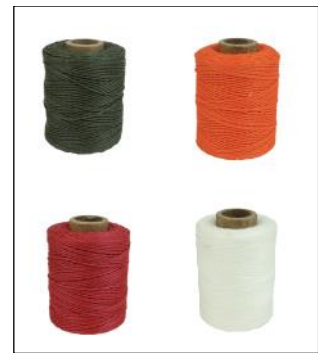
TW18-3W-2OL, OR, RD, WH