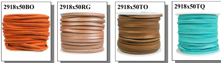
Left to right: Burnt Orange, Rose Gold, Toffee, & Turquoise