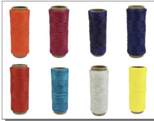
Top: TW160PPS-1OR, PK, PP, RB Bottom: TW160PPS-1RD, TQ, WH, YL

The single end imitation sinew is waxed and about 1/16" wide. 100% polypropylene with a 17-lb. break test strength. Made in the USA