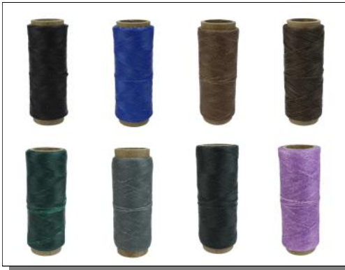
Top: TW160PPS-1BK, BL, BR, DB Bottom: TW160PPS-1EG, HA, HG, OC