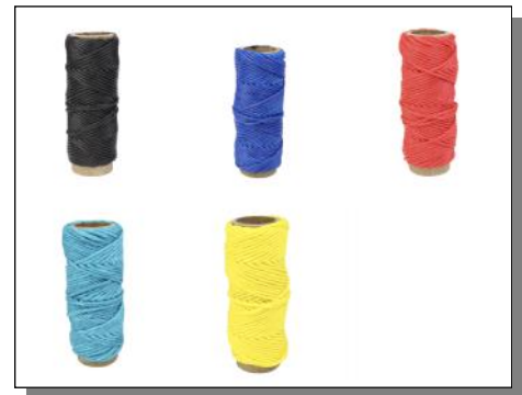
TWR520WPP-1BK, BL, RD, TQ, YL

The round imitation sinew is lightly waxed and is strong and smooth. 100% polypropylene.