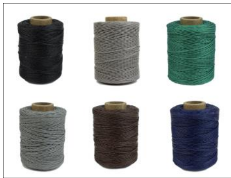
TW18-3W-2BK, BV, EG, LG, MA, NV