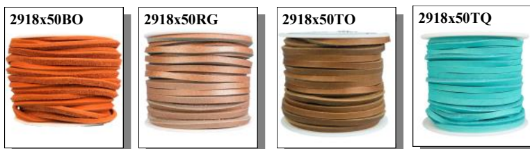
Left to right: Burnt Orange, Rose Gold, Toffee, & Turquoise

These heavy cow hide laces are 1/8" wide and are ideal for leatherwork projects. They come in 50-foot spools. This is suitable for re-lacing baseball gloves and for masculine-looking craft projects. We have also used them to lace boots that have gone to the South Pole and to Greenland. ( Bos taurus, ranch ).