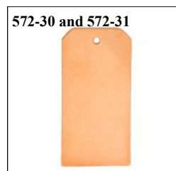
572-30 and 572-31