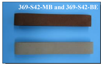
369-S42-MB and 369-S42-BE