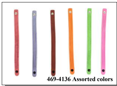
469-4136 Assorted colors

The mystery bracelets are 8½" long and come with pre-attached snaps. They are made using smooth cowhide and come in assorted colors. Each pack has two different color bracelets. Let us know if you have any color preferences. Instructions on how to braid are included. Recommended for ages 8 and up. ( Bos taurus, ranch ).