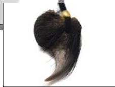
Close up of claw