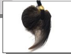
Close up of claw